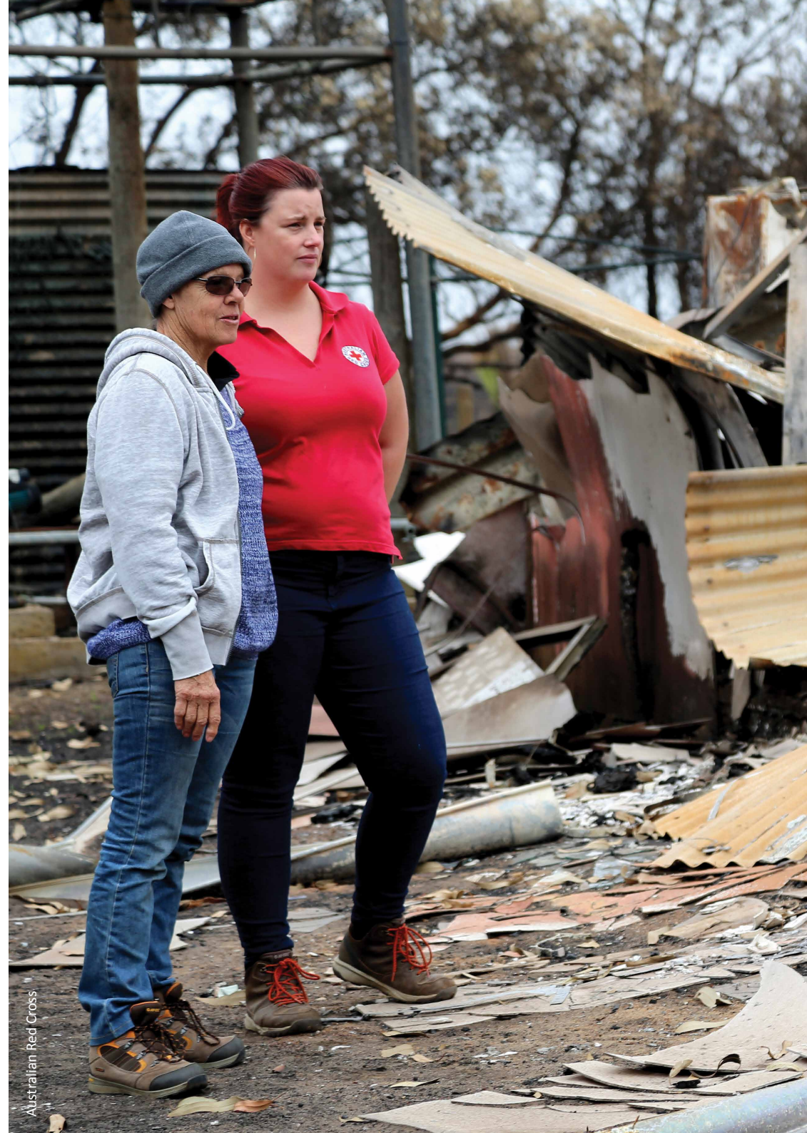
Australian Red Cross